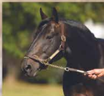
BETTOR'S DELIGHT $20,000 CDN