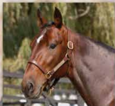
AMERICAN IDEAL $10,000 US

BLUE CHIP FARMS IS PROUD TO PRESENT ONE OF THE MOST DECORATED STALLION LINEUPS IN THE WORLD.