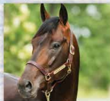
SUNSHINE BEACH $4,000 CDN

TO BOOK YOUR MARE VISIT WWW.BLUECHIPFARMS.COM 845-895-3930