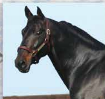
ROLL WITH JOE $4,000 US