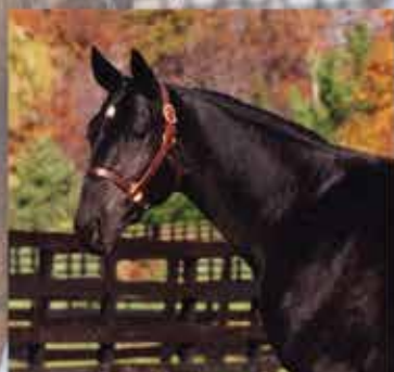
CREDIT WINNER PRIVATE TREATY