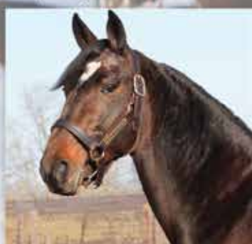
DEVIOUS MAN $4,000 US