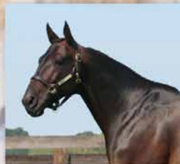
CHAPTER SEVEN $30,000 US